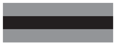
TRIPLE LAYER (18 mm)

THE SMALL KEYRING PART HAS ALWAYS THE SAME THICKNESS AS ITEM.